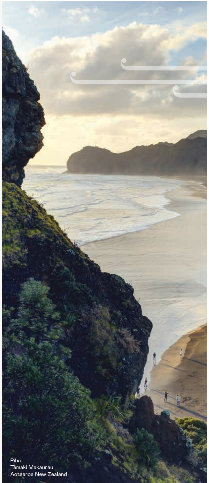
Piha Tāmaki Makaurau Aotearoa New Zealand

*Fidelity Life has an A- (Excellent) financial strength rating from A.M. Best. The rating scale that this rating forms part of is available for inspection at our offices. For more information please visit Fidelity Life financial strength page.